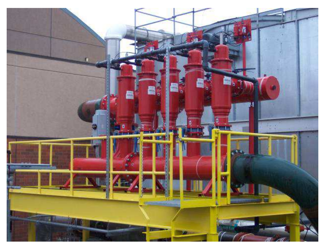
Figure 2. ORIVAL Five-Filter System