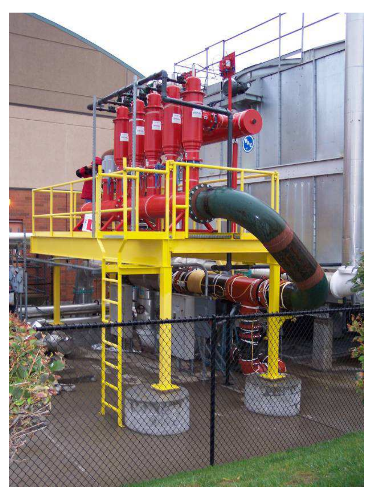
Figure 3. Filtration System Layout