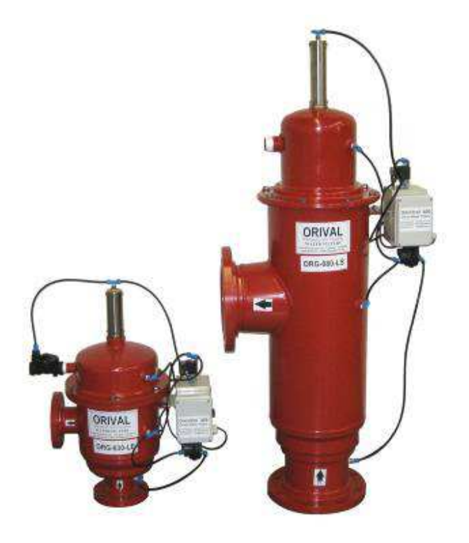
Figure 1. ORIVAL ORG Series Automatic Self-Cleaning Filters